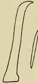
Phreatothrix cantabrigiensis .